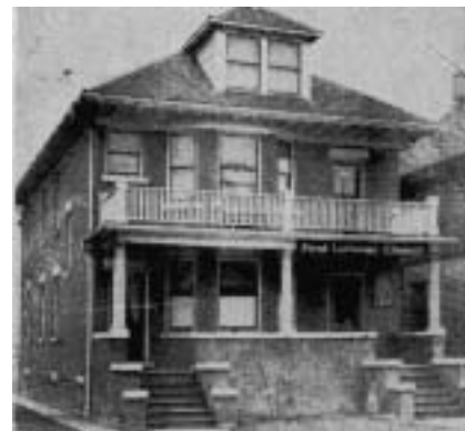
The Assumption St. Chapel: Our First Temple

(From The Windsor Lutheran, Nov. 1953. The "Silver Anniversary Edition.")