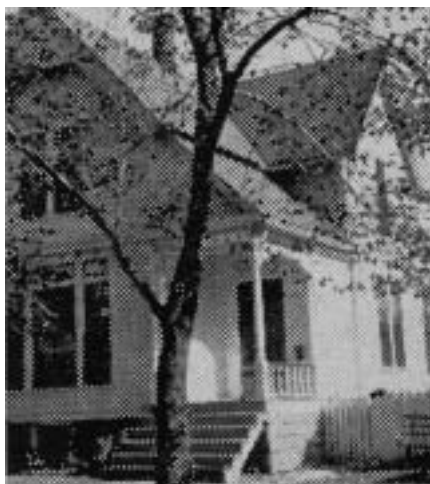
The Biggs Home: First is Organised