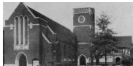
On Victoria: Sanctuary and Parsonage