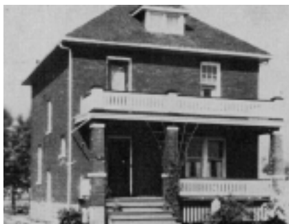
The Ritchie Home: First's Cradle